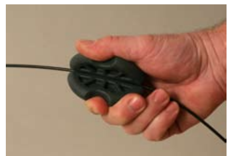
Use the pulling-pushing grip to get extra force if needed.

P.No. 10 m. 8003-0010S P.No. 20 m. 8003-0020S P.No. 30 m. 8003-0030S