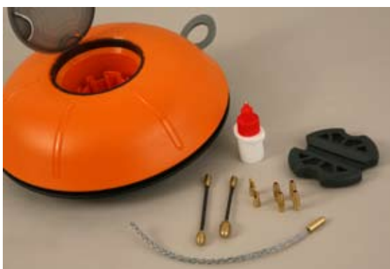
"SahlinaMina" with accessories

SahlinaMina is available with 10 m, 20 m or 30 m fiberglass rod, complete with M5 start and end joints, flexible start spinner with eyelet, pulling-pushing grip and accessories.