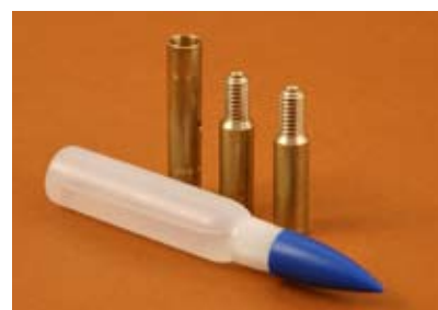
Repair kit containing joint sleeves and special adhesive, as well as directions for use.