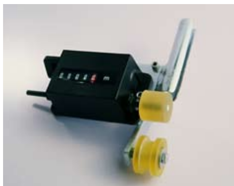
Length Gauge to be fitted on the frame's rod guide. P.No 8303-0010